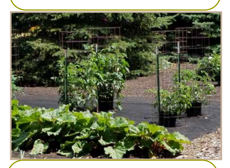
Creative, clean look to tomato cages