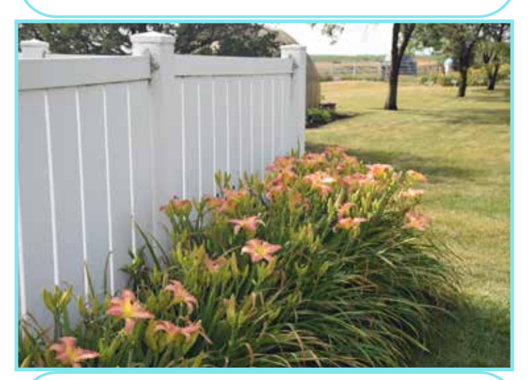
White fences highlight color and beauty Photo by Kyle Billadeau

Driftwood Gardens Photo by Kyle Billadeau