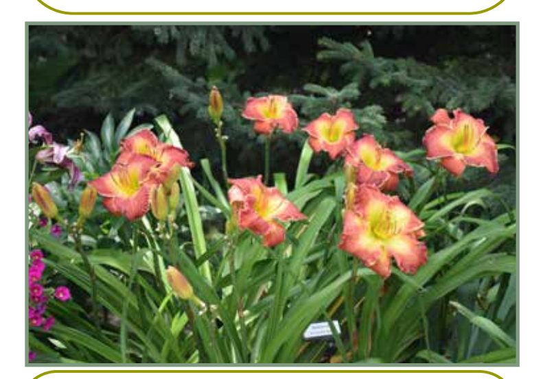
'Deliverer' (Emmerich, 2007)