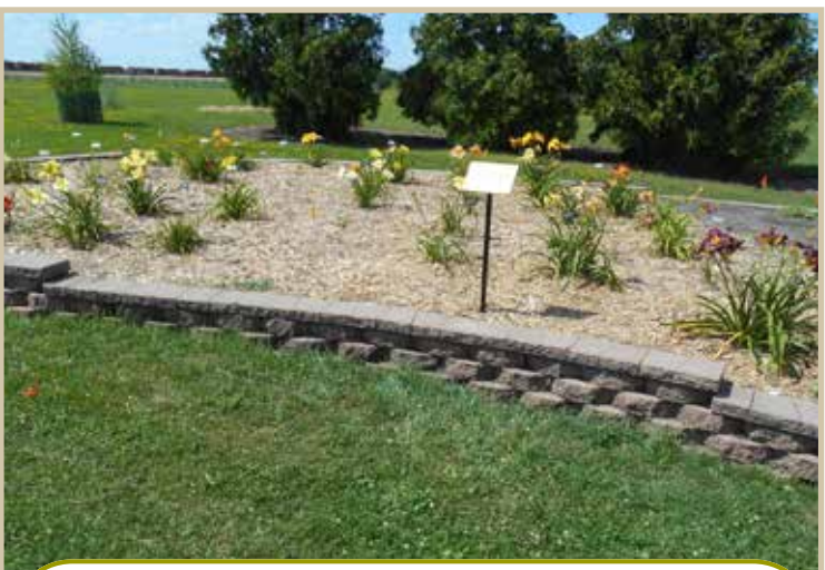
Lenington All-American Award Bed