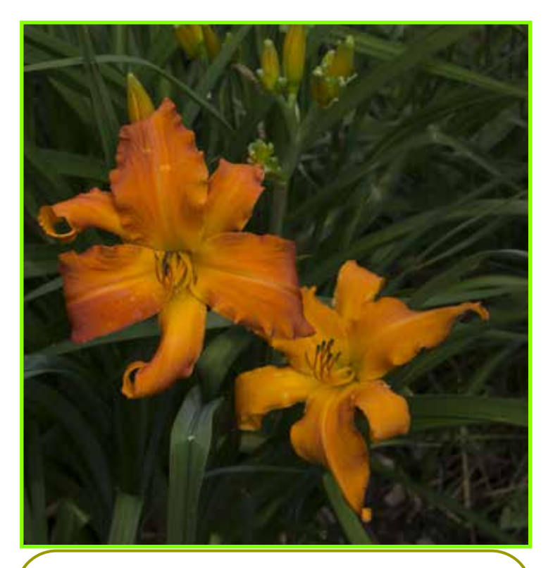
H. 'Primal Scream'

Quite simply, the Pop Poll represents favorites around the Region as voted by our own members. Daylilies that perform well in our Region are also likely to perform well in our own gardens. So I have personally used the Pop Poll to identify daylilies for my own wish list. This year I am adding five daylilies that I have consistently observed do well in the poll over the past couple of years.