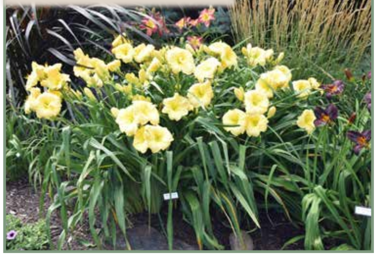
'lowa Sunshine' (Murdock, 2001)