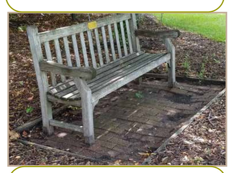
This brick base is a good idea.