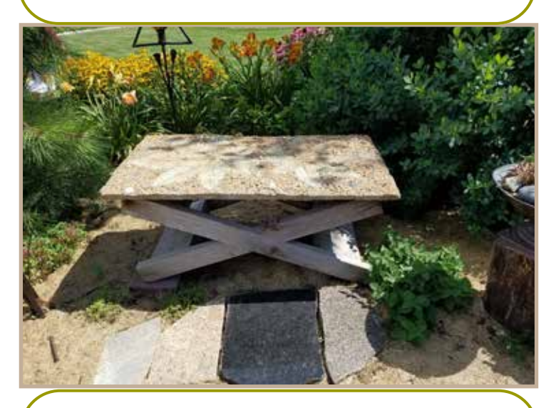
This great table is creative and useful.