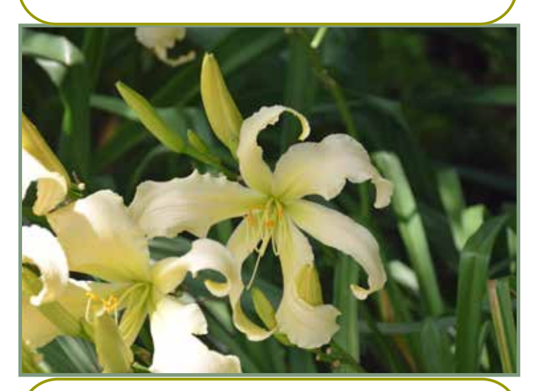
'Heavenly Angel Ice' (Gossard, 2004)