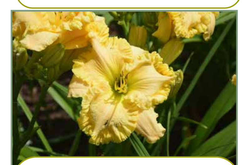
'Shining Through The Darkness' (Emmerich, 2012)