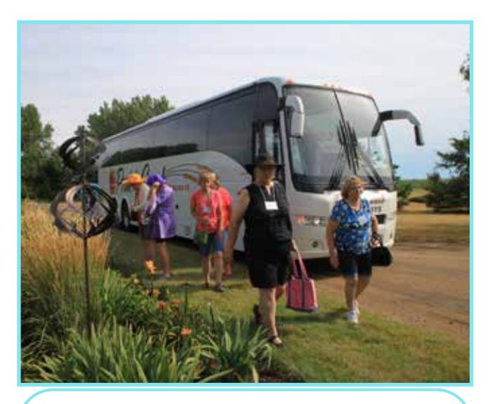
Tour bus arrives at Aughenbaugh Garden

It was a bit of a drive from the hotel to Vicky's place and this only served to heighten the anticipation of what awaited us in Vicky's garden. And the bus that