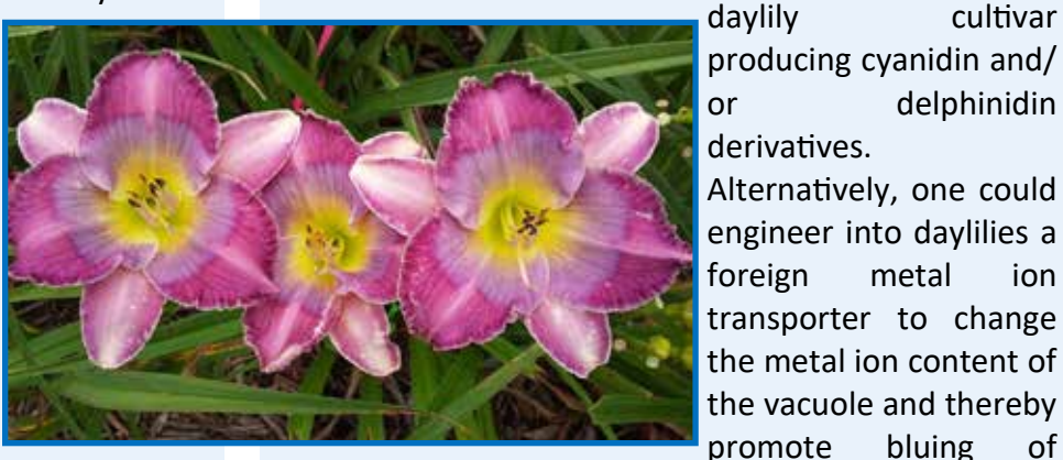
Fig. 4A. Jonathan Poulton seedling

Genes encoding several metal ion complexation. transporters have already been isolated, including the protein that transports ferric ions (Fe<sup>3+</sup>) into the vacuoles of cornflower petals (Yoshida and Negishi, 2013).