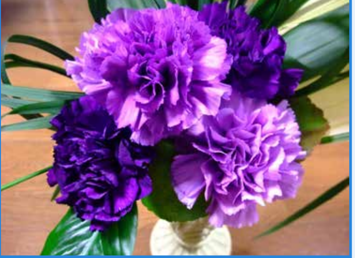
Fig. 1. Moon series carnation cultivar Moondust

plants use to promote outcrossing, in which he introduced us to the four major classes of plant pigments that confer color upon flowers. In addition to the green chlorophyll pigments, plants may possess betalains, carotenoids, and flavonoids. Whereas betalains are restricted to a few species beetroot, bougainvillea, and portulacas), (e.g. carotenoids and flavonoids are broadly distributed floral pigments. Carotenoids generally confer yellow or orange coloration, as illustrated by marigolds and The best known flavonoids are the daffodils. anthocyanins, which impart to flowers a wide range of colors from salmon and scarlet through red and purple to blue and blue-black. By the early 1970's, the Plant Kingdom was known to produce several hundred anthocyanin pigments, most of which are based on the three parental compounds pelargonidin, cyanidin, and delphinidin. The widely accepted dogma at that time was that pelargonidinbased anthocyanins gave rise to orange blooms (e.g. pelargoniums), whereas cyanidin-based anthocyanins led to pink to red flowers (e.g. roses). Furthermore, it was believed that plants absolutely required delphinidin-based anthocyanins to display the pure