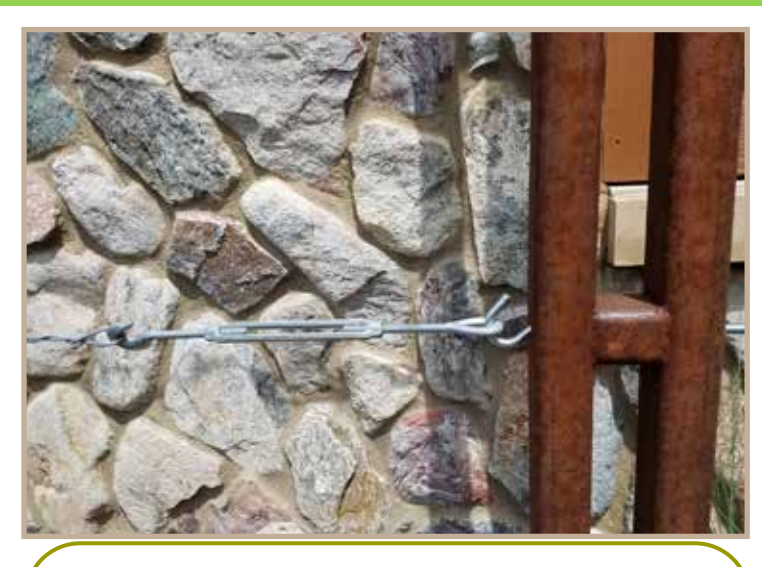
A cable and welded steel trellis for espaliered trees