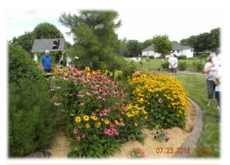
Healthy and vibrant cone-flowers