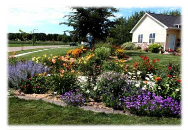
Corner bed full of fall color