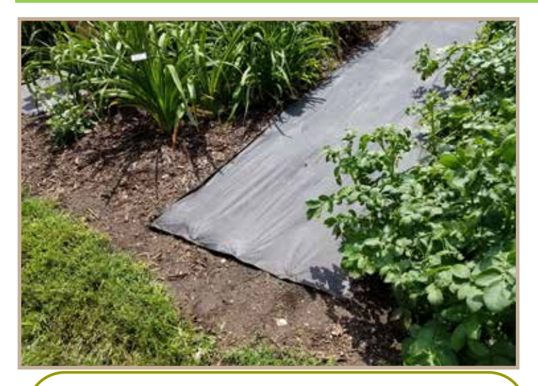
Brilliant use of landscape fabric