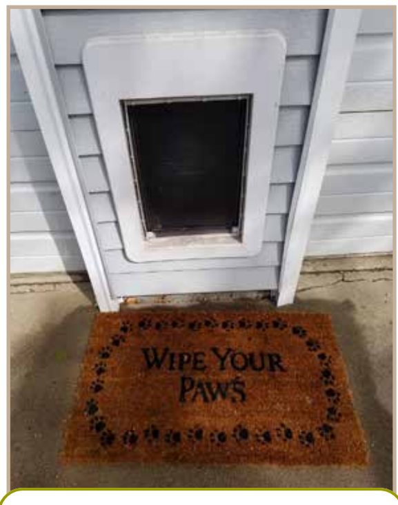
The "In" door