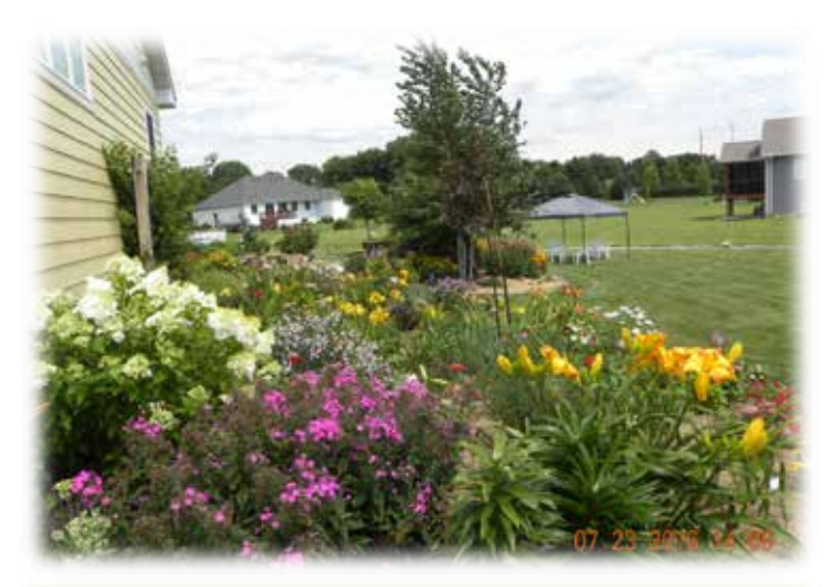
Excellent use of perennials to enhance daylilies