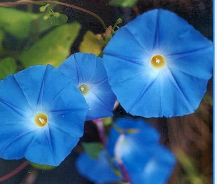
Fig. 3. Morning Glory cultivar Heavenly Blue

freesias that display such vibrant blues. Hoping to better understand the chemical wizardry of these species, several University of Iowa Biology Honors students and I recently searched the scientific literature. We learned that the anthocyanin flower pigments accumulate within plant cells in membranous, water-filled bags called vacuoles. Coexisting in these "storage depots" are colorless flavonoids and metal ions (e.g. aluminum,