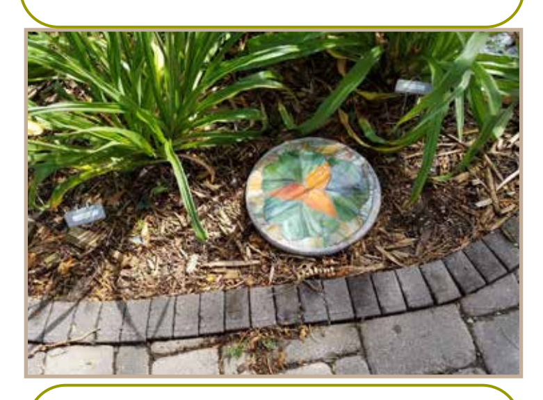
A daylily stepper, what a great idea!