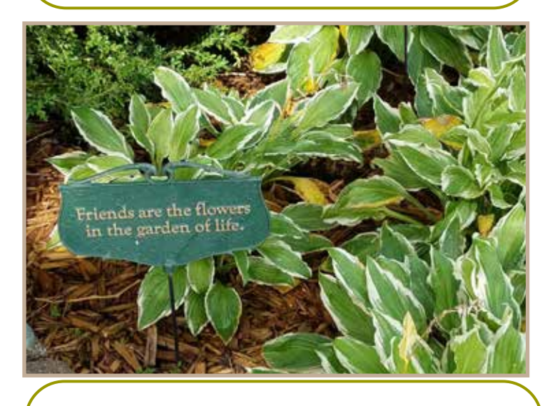
What a nice sentiment.