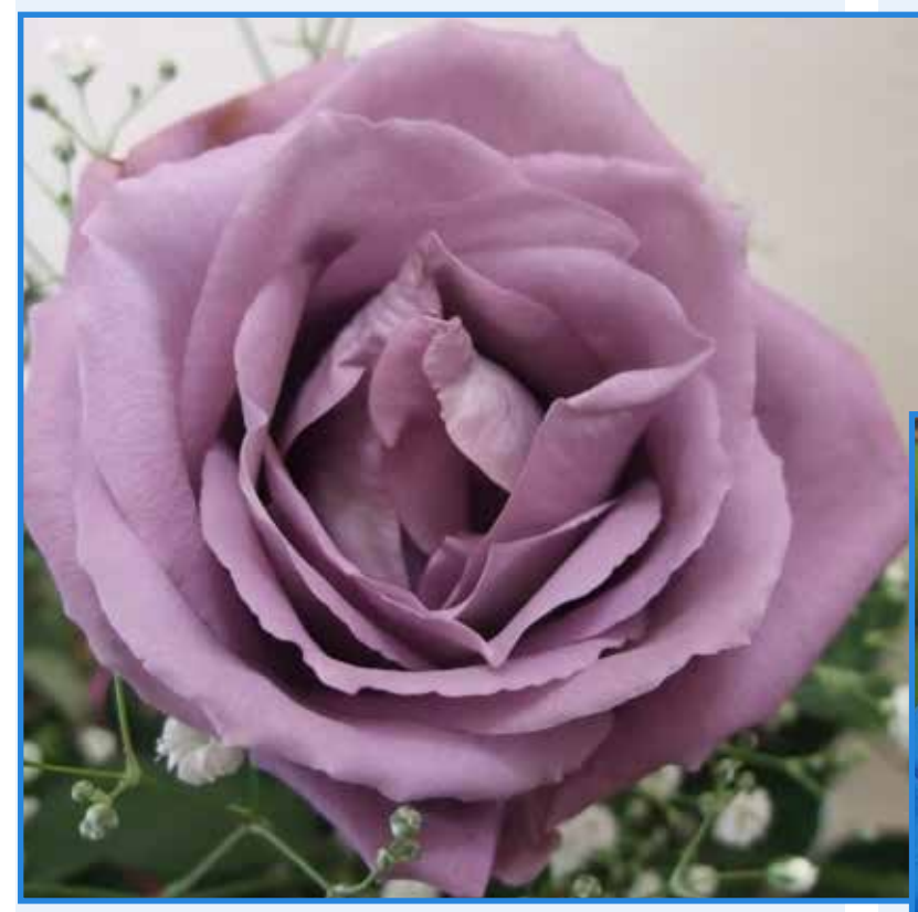
Fig. 2. Suntory blue rose cultivar Applause

genetically-engineered flowers in the world to be commercialized. Millions of these flowers, with shades ranging from blue-violet to deep purple, have been sold worldwide. In 2003, Florigene was bought out by Suntory, a Japanese beverage and food