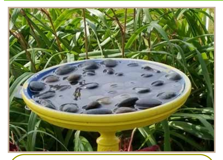
For songbirds and butterflies