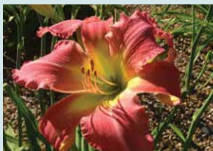
CHRISTMAN GARDEN