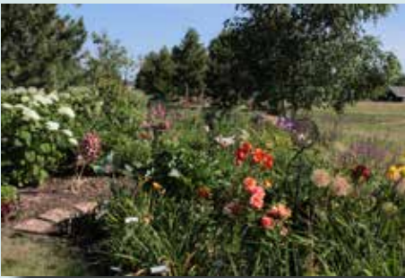
FAYE & DENNIS KROH GARDEN