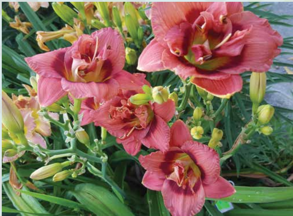
H. Blufftop Puffball.