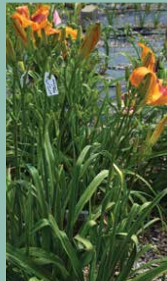
First bloom I saw in the garden of 11NR289B flower.

Beside my notes, I take pictures of all the plants I flag each summer. This gives me a year by year confirmation of what the plant is doing in my garden. I will now show you pictures of all the information on this plant. Your camera sometimes catches things you don't see.